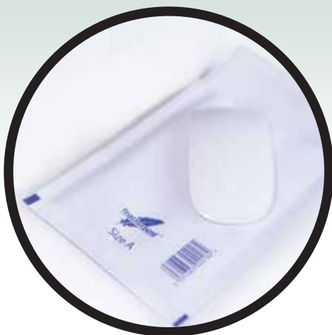
For online goods

Featherpost Bubble Lined Mailers, an economical and practical lightweight postal bag. Designed to accommodate most requirements from small items, such as jewellery and watches, to larger or multi product mailings