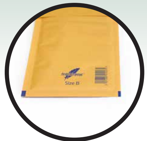
Registered Print & Barcode