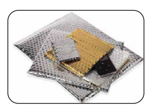
Metalised Foil Pouches